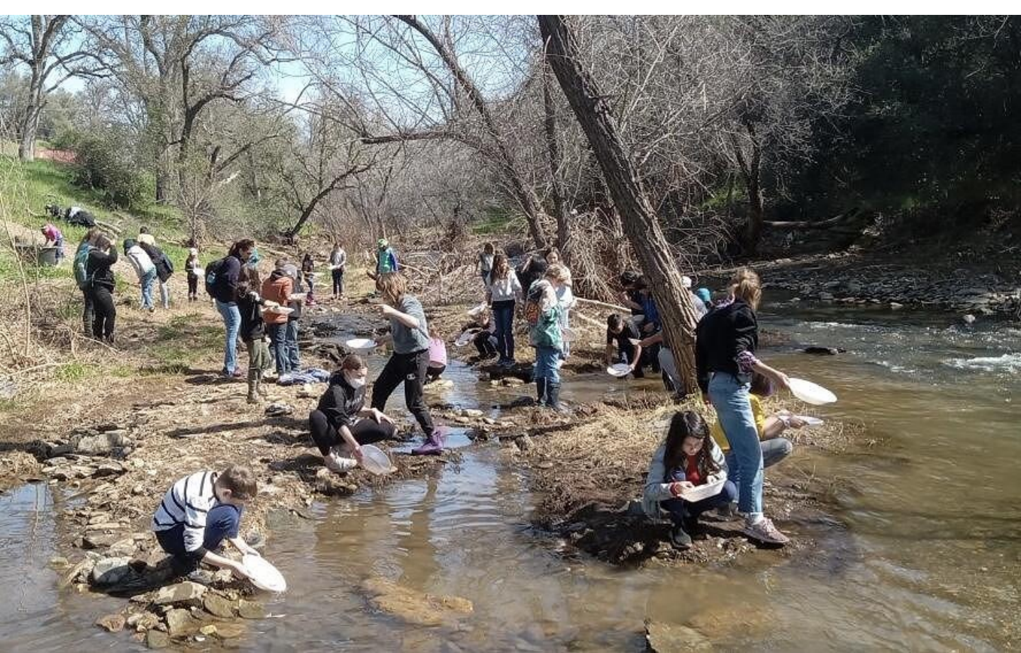
Tourists are seen panning gold during a tour with the California Gold Panning.

“I think this summer. I’m going to be swamped,” he said. “We’ll probably get 10 groups a day.”